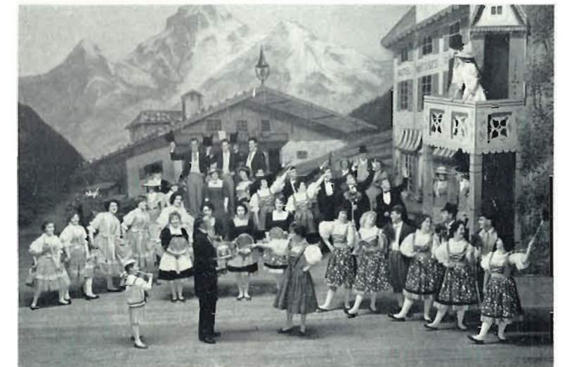
"The White Horse Inn"