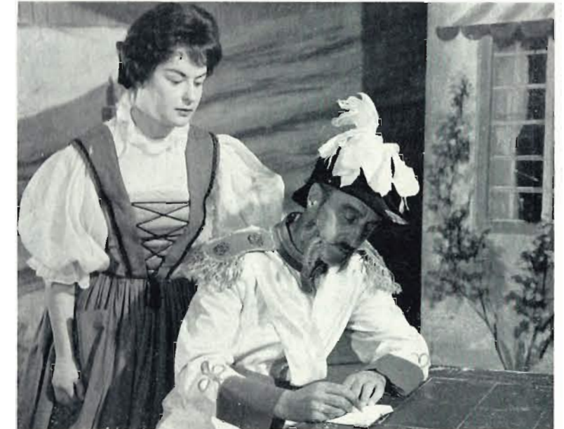
"Josepha and the Emperor"

ENTR'ACTE AND SERENADE—Chorus. RECITATIVE—Emperor. REPRIS—Sutton and Ottoline. TYROLEAN DANCE—The Boys. "MY SONG OF LOVE"—Sutton, Ottoline, Chorus and Ballet. REPRIS: "SIGISMUND"—Sigismund and Gretel. FINALE—The Company.