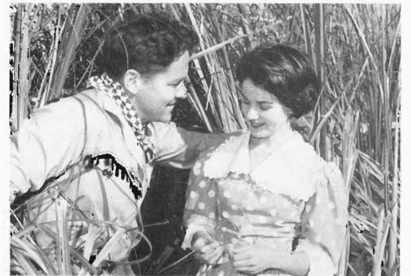
"Curly and Laurey"