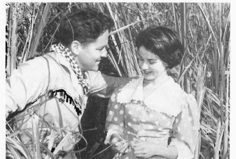
"Curly and Laurey"