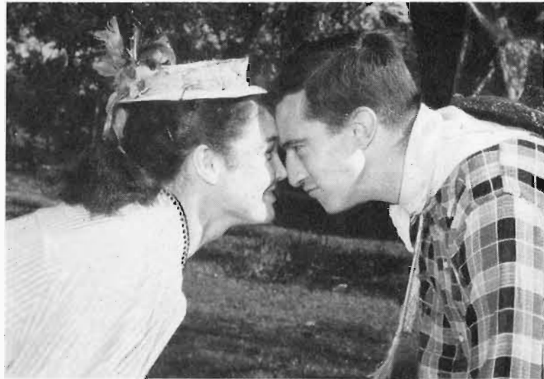
"Ado Annie and Will"