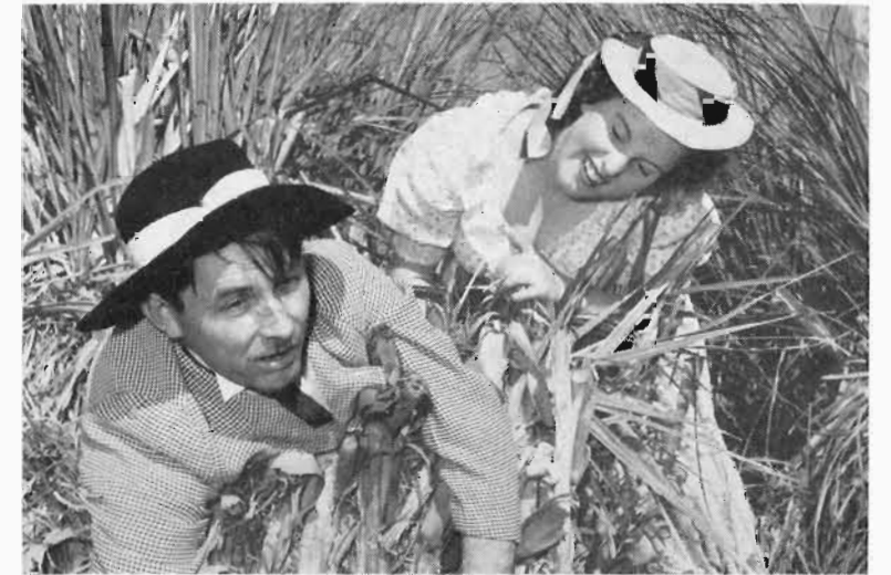
"Ali and Gertie"

"THE FARMER AND THE COWMAN"—Carnes, Aunt Eller, Curly, Ike Skidmore, Will, Ado Annie and Ensemble. "ALL ER NUTHIN'"—Ado Annie and Will. Reprise—"PEOPLE WILL SAY WE'RE IN LOVE"—Curly and Laurey. "OKLAHOMA!"—Curly, Laurey, Aunt Eller, Ike, Slim and Ensemble. FINALE—Ensemble.